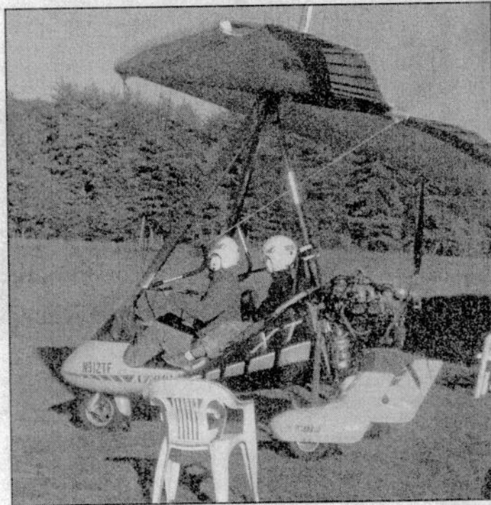
Scouts from Troop 382 learning how to fly.

buildings of Boston, and green trees as far as the eye could see. For many of the scouts, the chance to actually control the plane and feel it respond to their touch was beyond their wildest dreams. Unfortunately the dream had to end so the next person could go on, although the memory of the day will last forever.